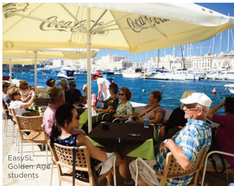
EasySL Golden Age students