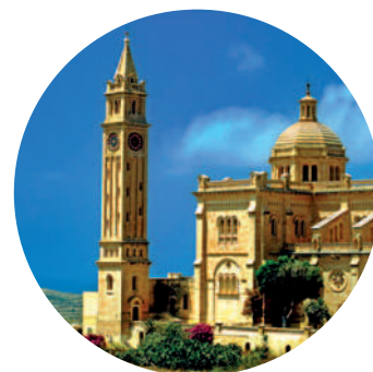
Ta' Pinn Church