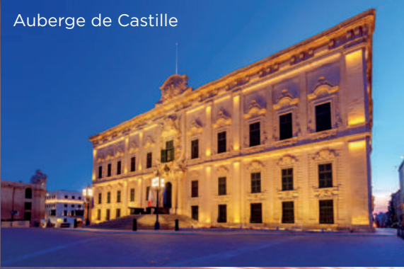
Auberge de Castille