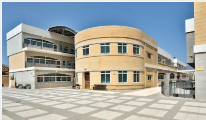
EasySL Junior School.