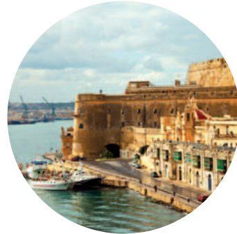
Valletta Grand Harbour