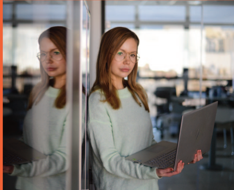
EasySL Interns at their workplace.